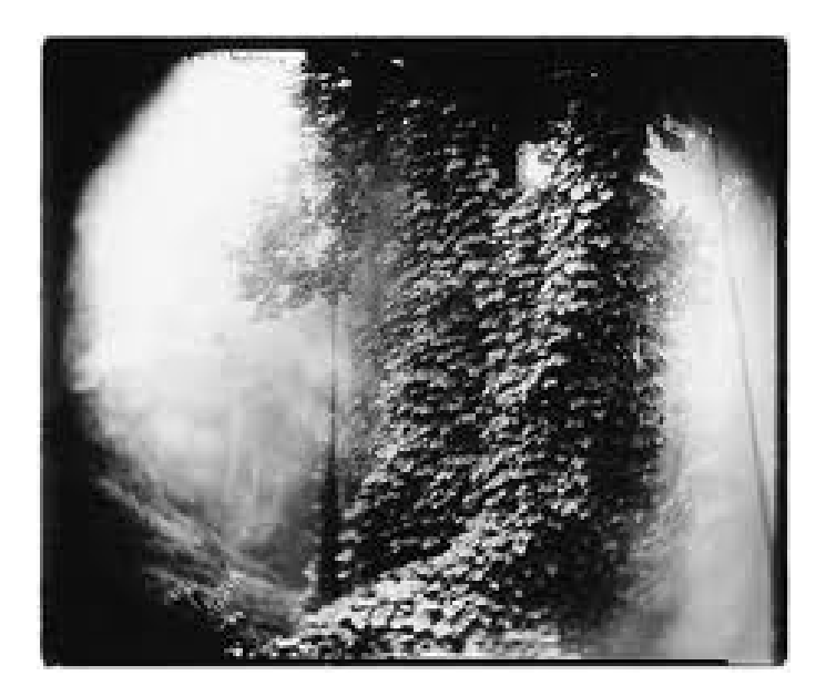
Untitled Georgia Landscape, Sally Mann

All of these images are considered landscapes. Think about how different images of land, either natural or man-made can represent still.