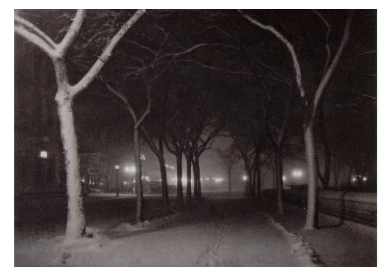
Icy Night, Alfred Steiglitz

Look at the images on this sheet. Identify the artist. Discuss how the photographer worked with the idea of stillness . Be specific. Does the particular way the artist used light have meaning? If so, how? How does the composition impact the meaning and visual interest of the image?