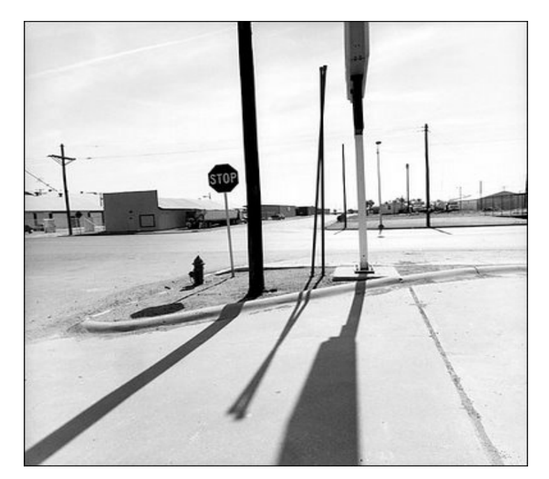
New Mexico, Lee Friedlander