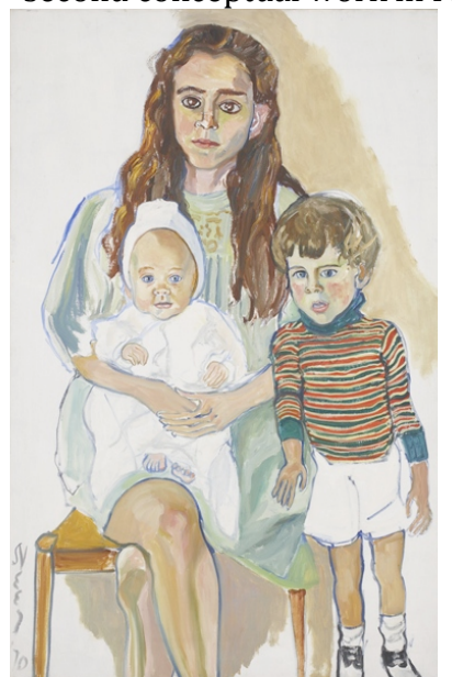
ce Neel - Julie and Children, 1970 - Oil on canvas, 45 x

Homework Assignment : This assignment is the second conceptual work in Figure Drawing. It