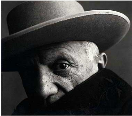
Picasso, Irving Penn

Then analyze and discuss what the photo says about the person being portrayed.