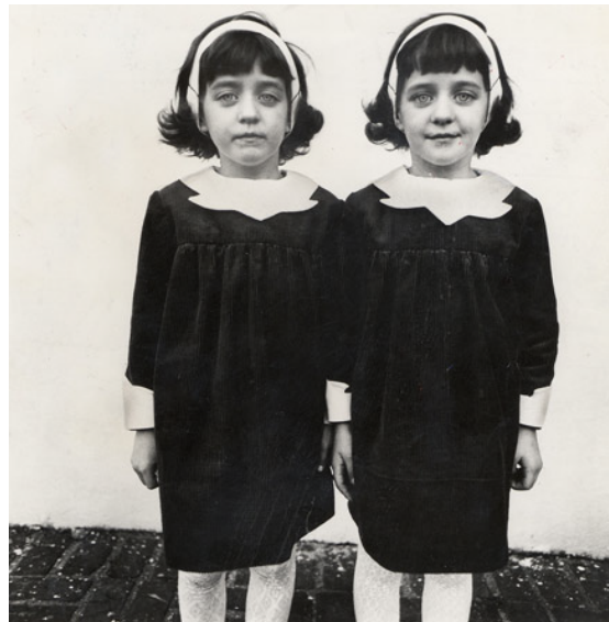
Twins, Diane Arbus