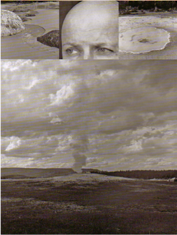
Hole, from the Return Trips series, Bea Neattles

Look at the images on this sheet. Identify the artist. Discuss how each image says something about this particular artists place in the world . Be specific What is it about the photo that makes it seem unique to the artist? Could it be anyone's place in the world?