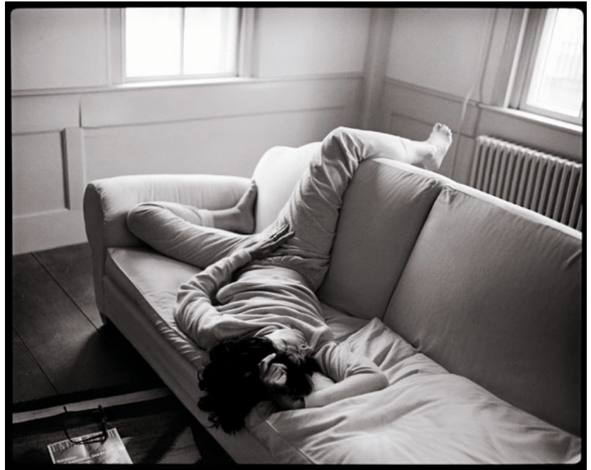
Susan at Home, Annie Leibovitz