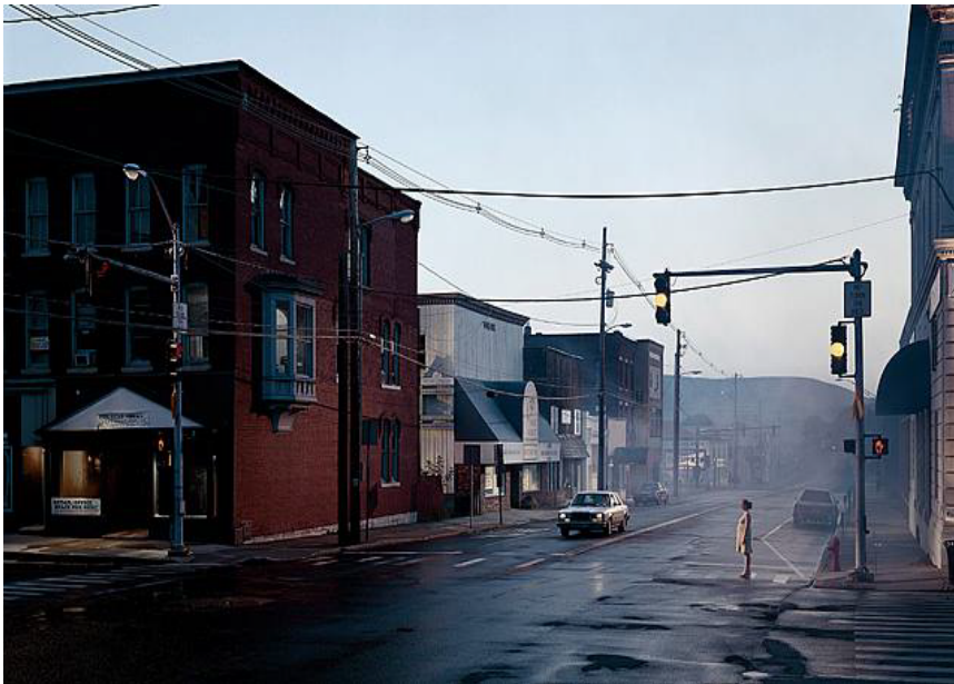
Beneath the Roses, Gregory Crewdson