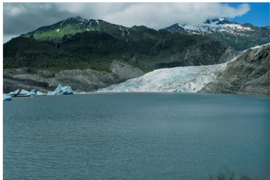
Alaska's Mendenhall Glacier May 2007 and July 2010.