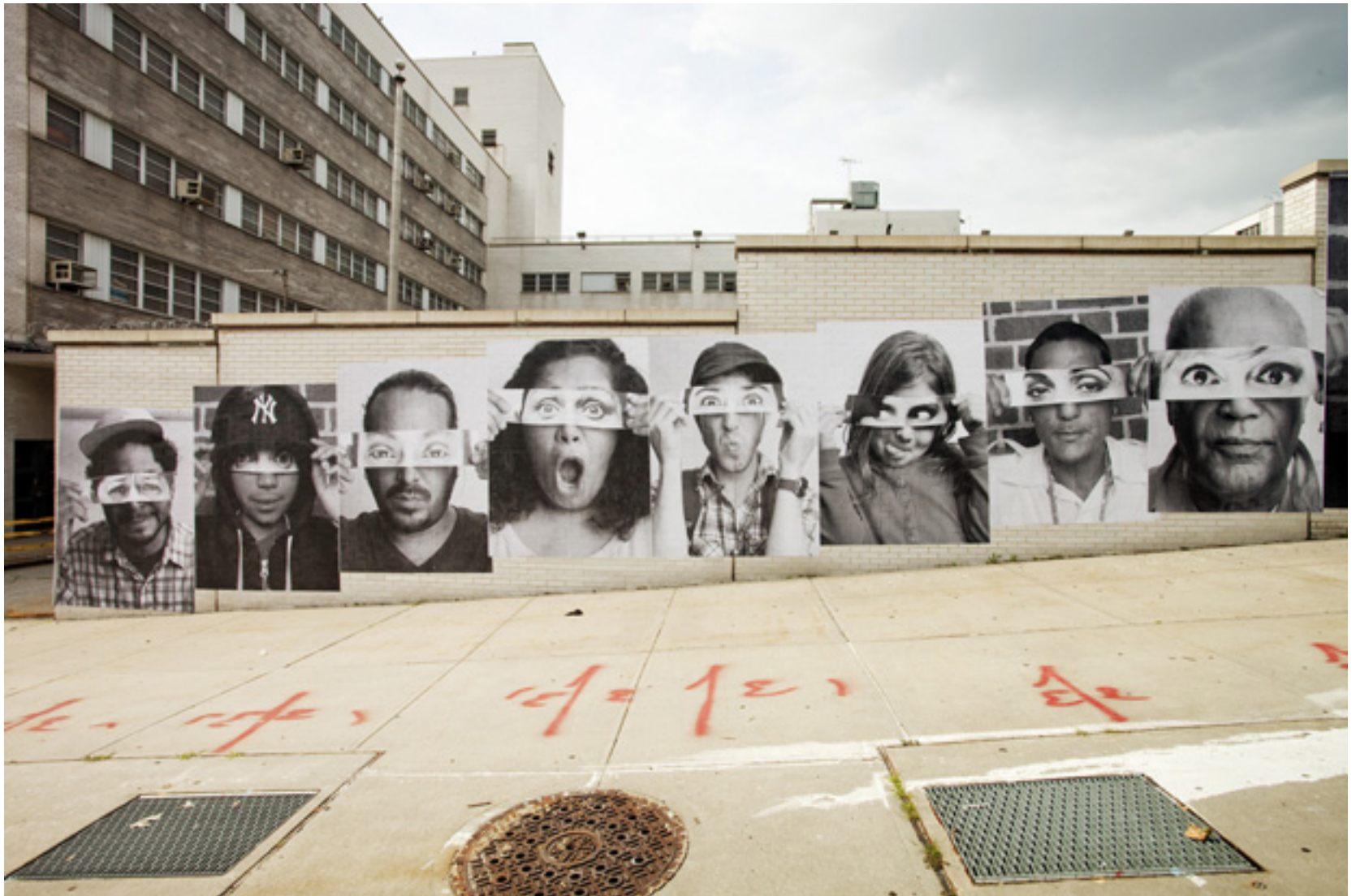
JR, People's Project, NYC