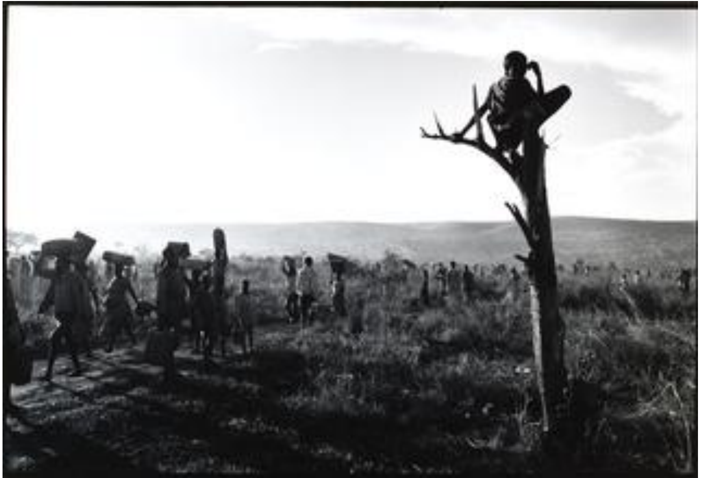
Gilles Peress, A Vision of Iran— images of Iran's postrevolutionary chaos.