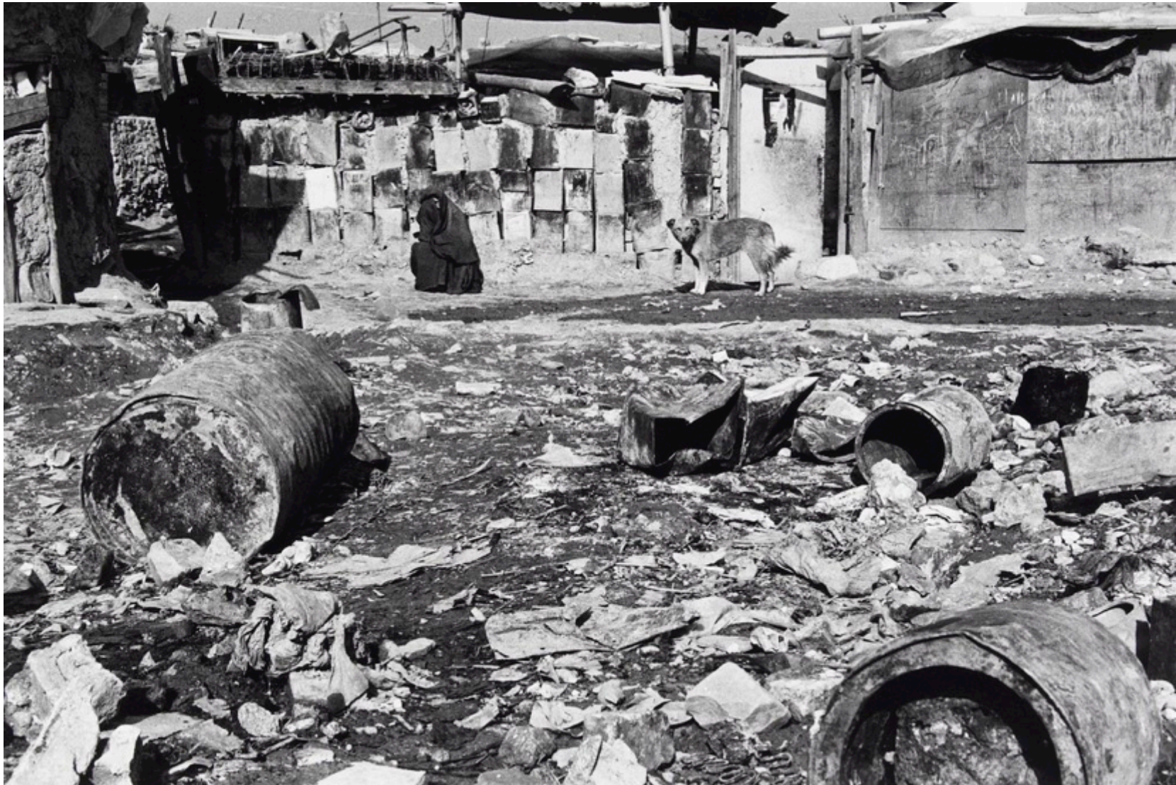
Gilles Peress, A Vision of Iran– Used the word vision to acknowledge that no one knew what was happening.