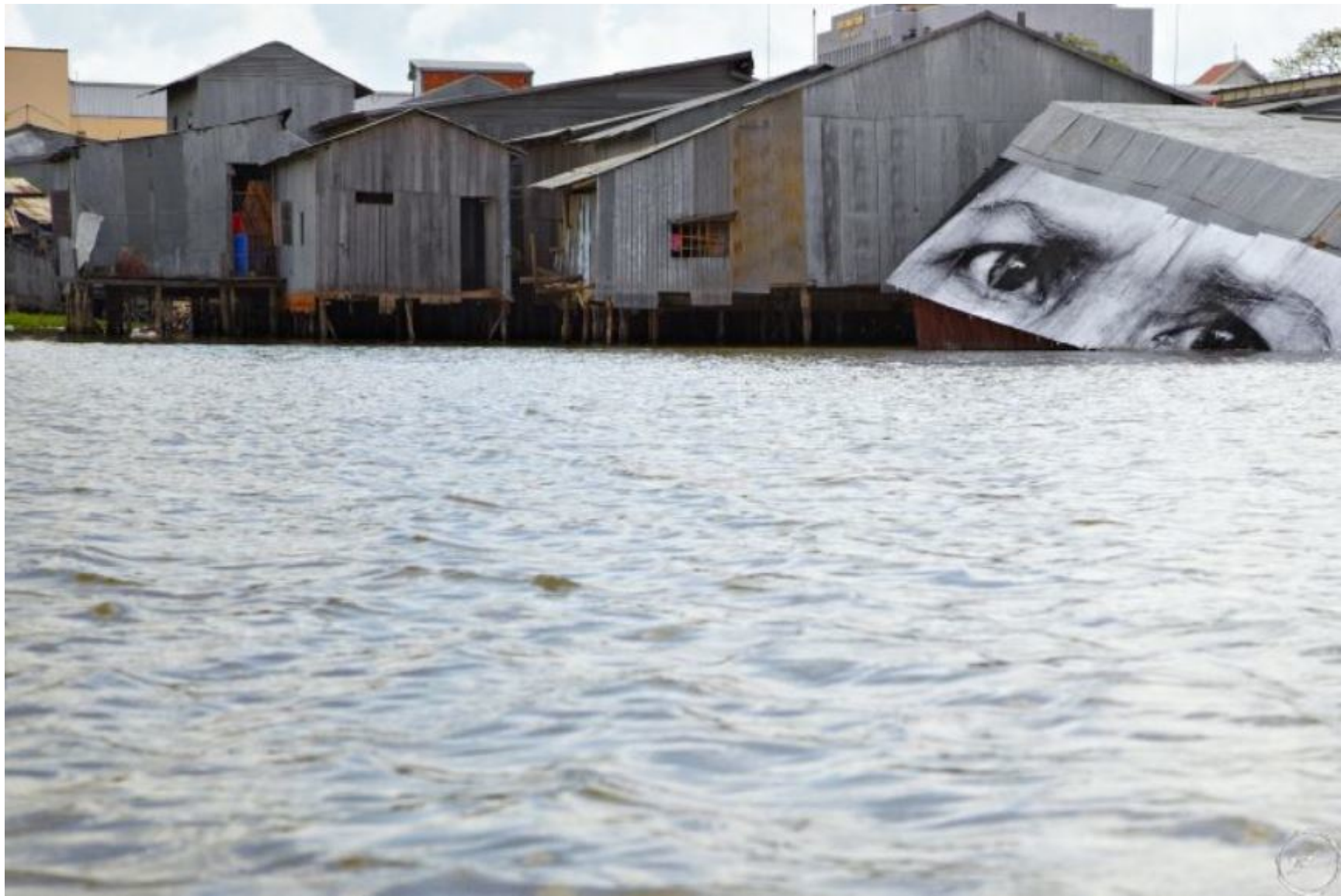
JR – Women are Heroes, Action in Phnom Pen, Old Station, Cambodia, 2009