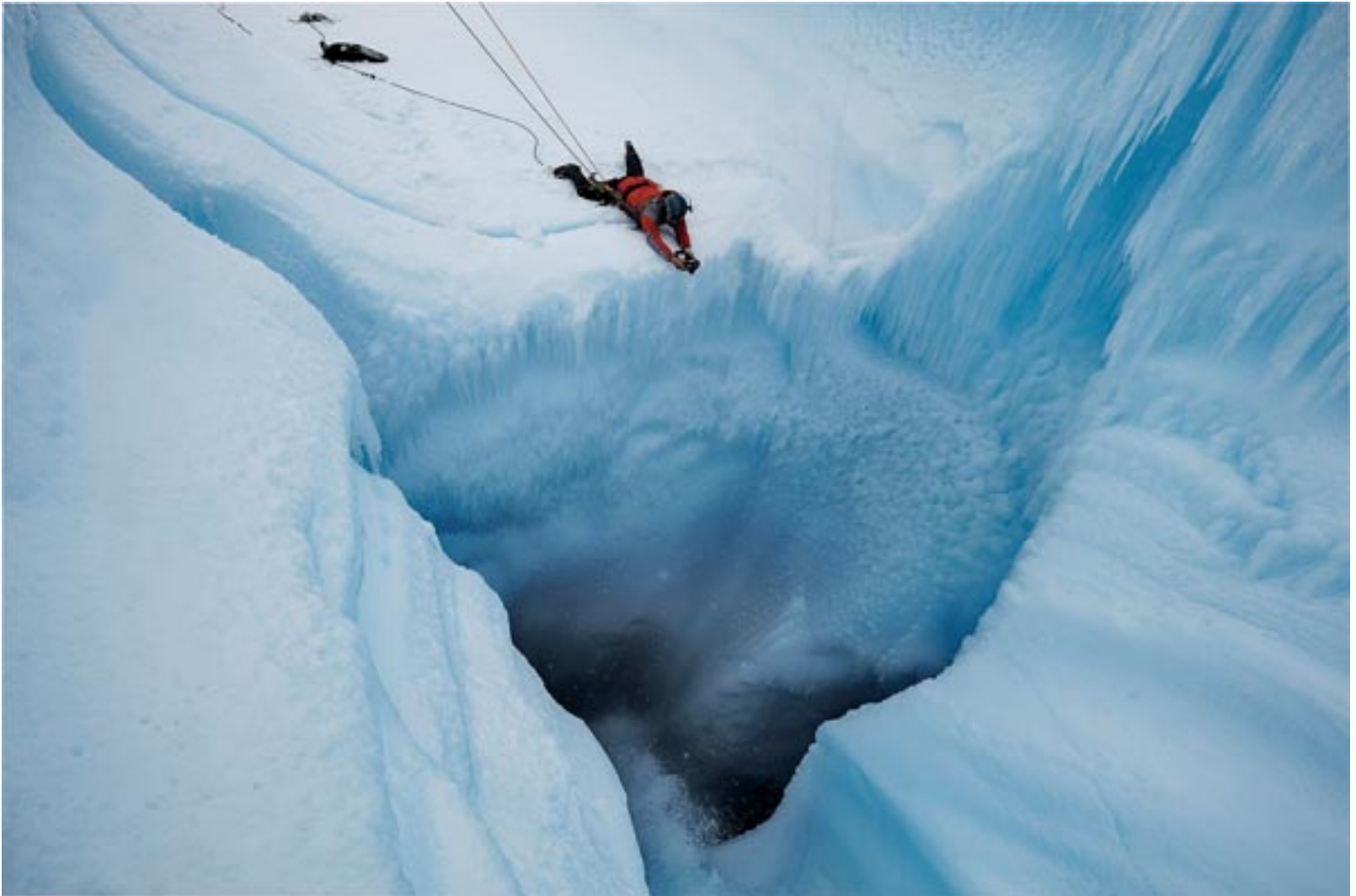
Melting Ice burg in Greenland James Balog photographing Survey Canyon, Greenland ice sheet.