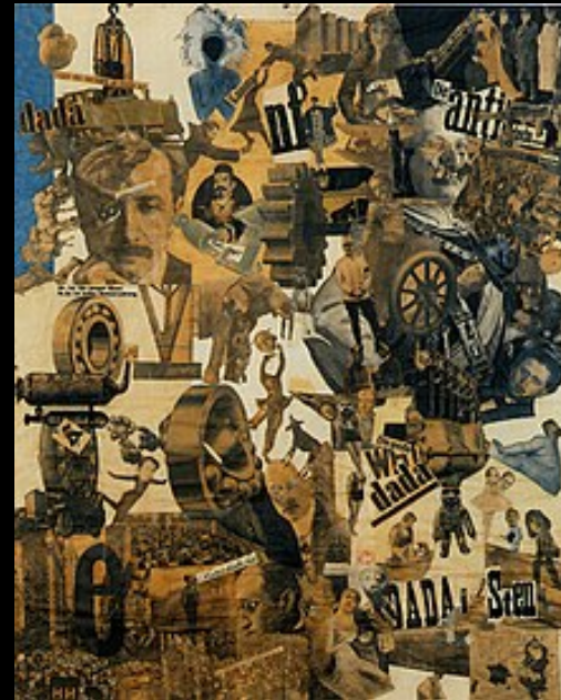
Hannah Hoch, Cut with a Kitchen Knife through the Last Weimar Beer-Belly Cultural Epoch in Germany, 1919