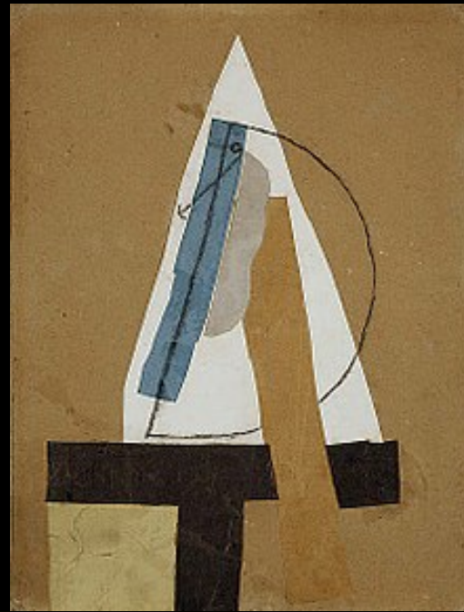
Pablo Picasso, Head, 1913

Collage was constructed of pieces of paper and magazines. It was inherently flat and made of ordinary materials.