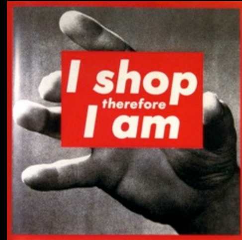
Barbara Kruger, Untitled: I shop therefore I am, 1987

The ideas of Feminism, the Civil Rights Movement, Counter Culture wars, Gay Rights, along with the ideas of multiculturalism, colonialism, dualism, postmodernism and the historic reality that many individuals outside the 'mainstream' were marginalized or invisible in both art and society brought a new wave in art.