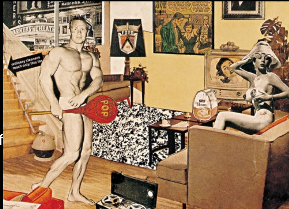
Richard Hamilton, Just what is it today that makes today's homes so different, so appealing , 1956

Hamilton's collage took images from advertising to create an ironic image of the American Dream.