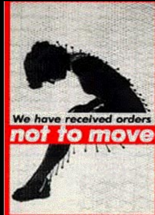
And Untitled: We have received orders not to move, 1982