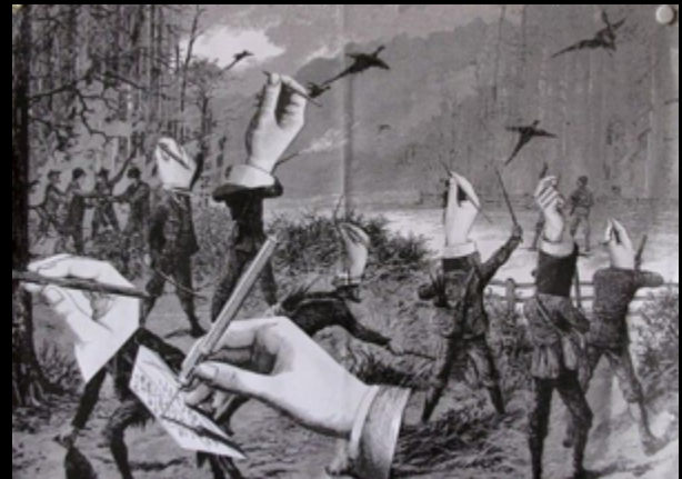
Max Ernst, two collages used as magazine illustrations , 1930s 5