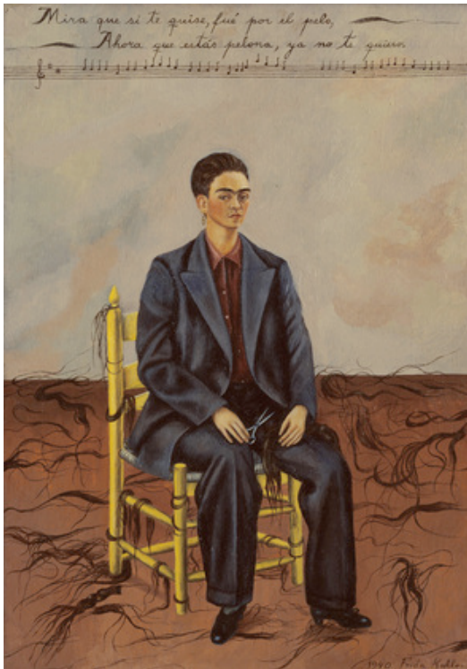
Self-Portrait with Cropped Hair, Frida Kahlo, 1940

Find information on the Museum of Modern Art website. If you are going to MoMA on Friday, find the work and write about the difference of seeing it in person.