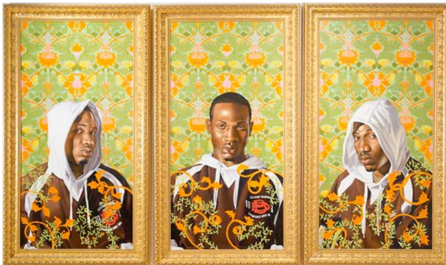
Triple Portrait of Charles I, Kehinde Wiley, 2007

http://www.moma.org/learn/moma_learning/frida-kahlo-self-portrait-with-cropped-hair-1940