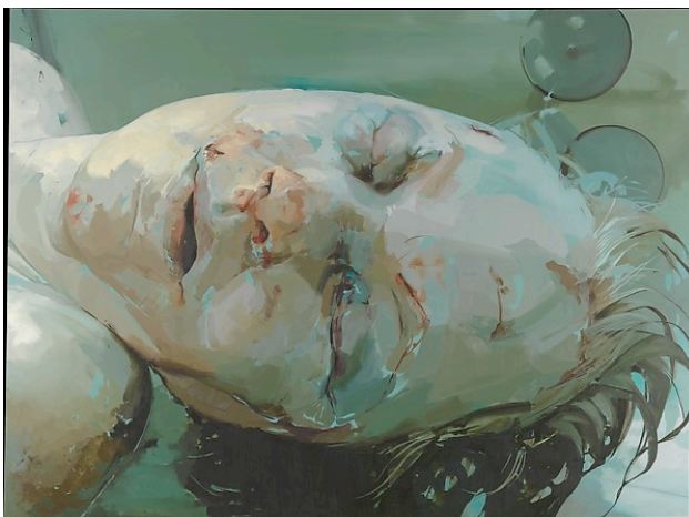
Still, Jenny Saville, 2003

Same with Jenny Saville below if link doesn't work.